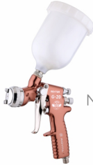
G-20 With Nylon Cup